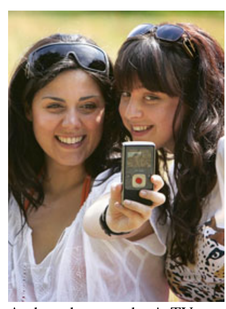
And send to grandma's